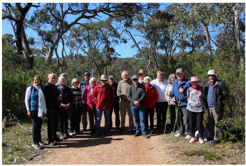
Belair National Park