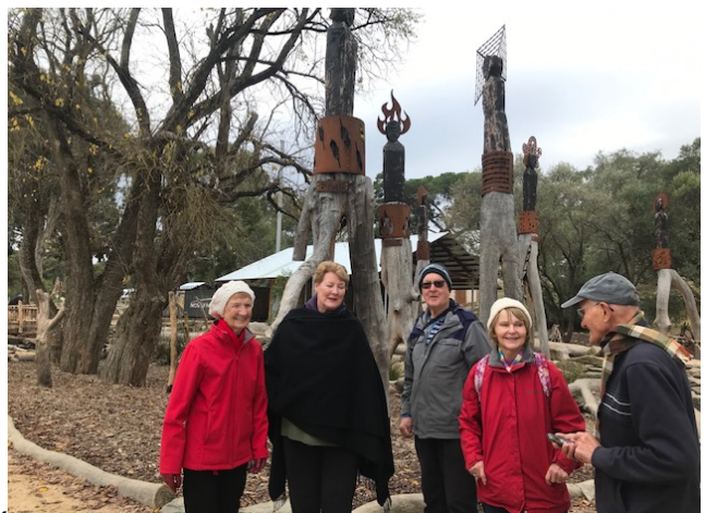
Glenthorne National Park