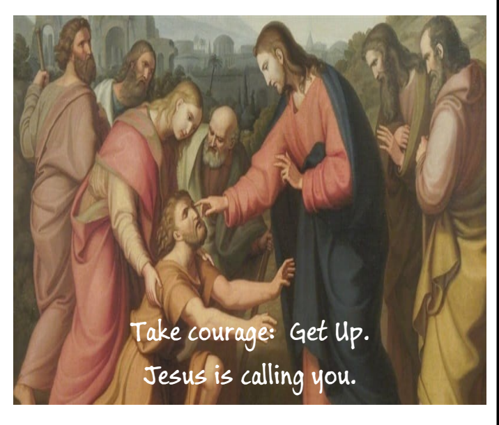
Next week's readings - 3 November, 2024 31st Sunday in Ordinary Time

First Reading Responsorial Ps Second Reading Gospel Acclaim Gospel